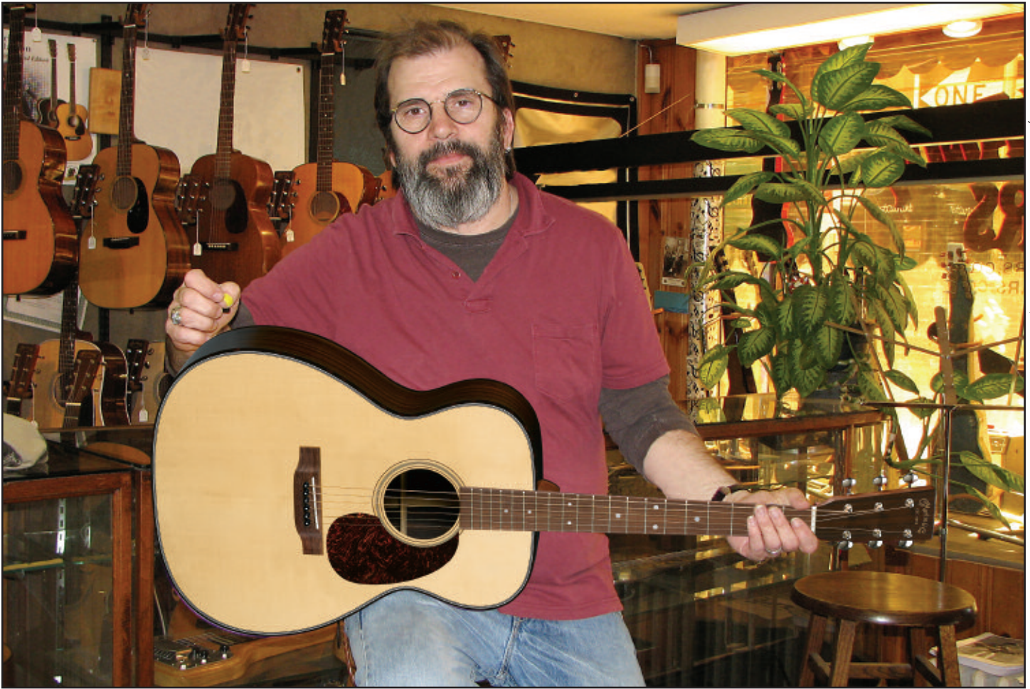
Prodded by the sonic superiority of his various M-sized Martin models, Steve Earle chose to preserve everything important to tone while discarding decoration. The result is a plain but powerful stage and studio guitar suitable to the professional player.

headstock a decidedly “old school” look. The fingerboard features Style 21 “Doppler dot” (progressively smaller) position markers from the 5th to the 17th frets, and the “black with white dots” bridge pins and end pin are also Style 21.